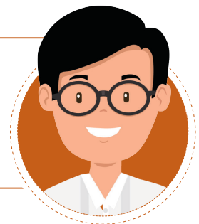
ILLUSTRATION OF PRACTICE NO. 4:

Collegial discussions can also happen through a classroom visit. Read the sample illustration of practice and find out how this can help you enhance your teaching.