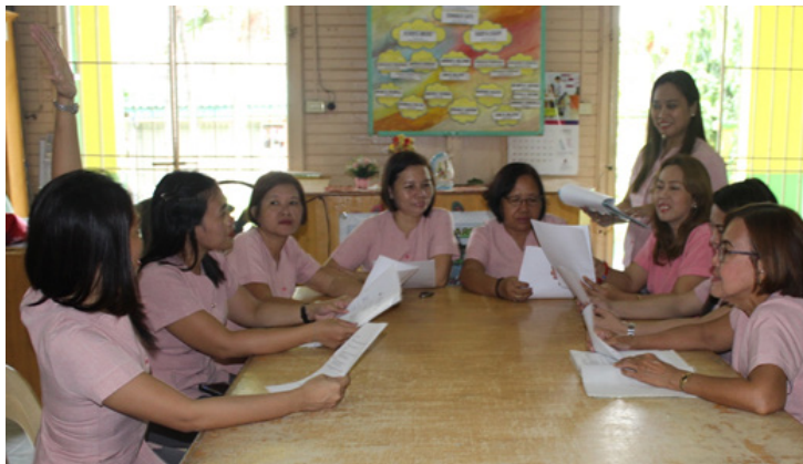
Teachers of Rosario Elementary School engage in a collaborative learning session that discusses the different strategies in learning areas in K to 12.

The LAC leader then evaluates the teachers' application of learnings from the LAC through classroom observation.